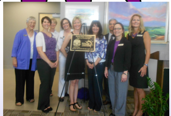
KSU Speech and Hearing Faculty members with RiteCare® brass Plaque presented by the Scottish