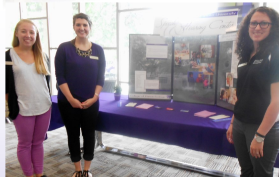
Speech and Hearing Clinic Display Table