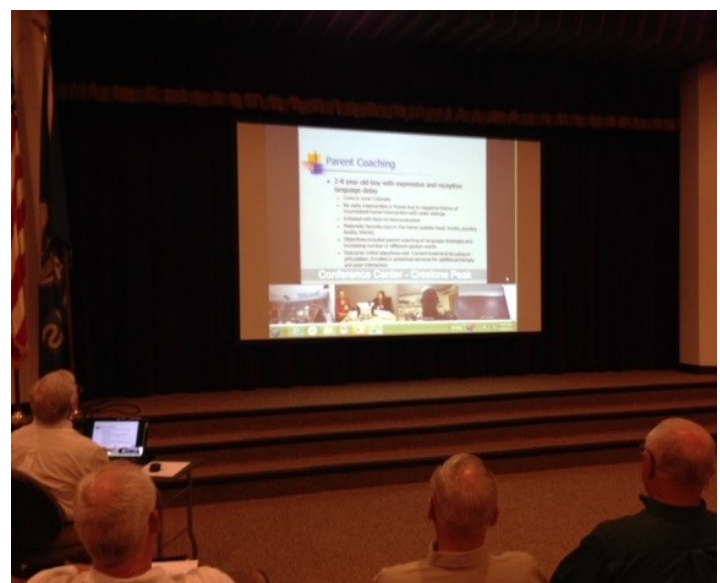
RiteCare® Telepractice Teleconference