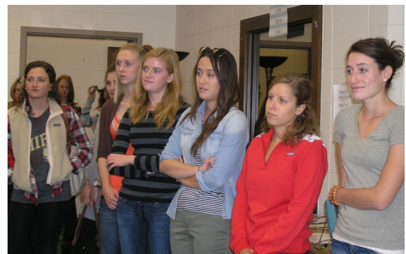
Speech & Hearing Students—Schiefelbusch Clinic