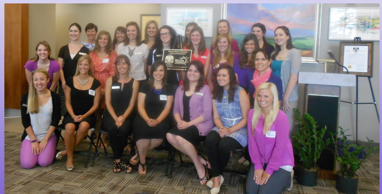
KSU Speech and Hearing Students with RiteCare® brass Plaque