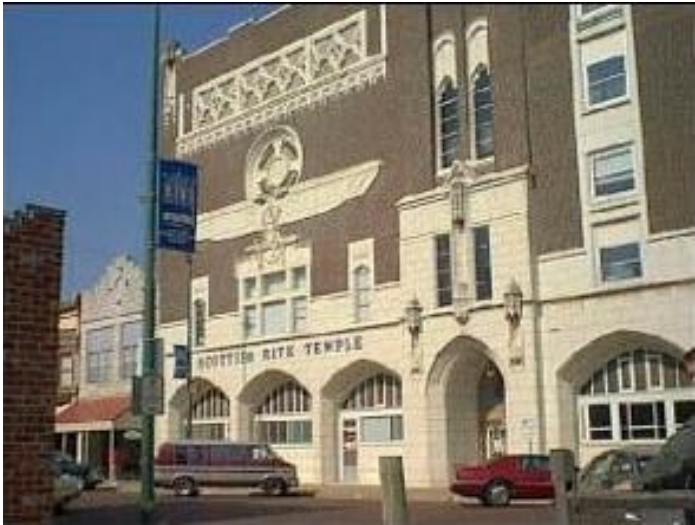
Ft. Scott Scottish Rite Temple 110 S. Main Street Ft. Scott, Kansas

The Fort Scott Valley is presently undergoing a sales of its Temple in Ft. Scott and a major relocation.